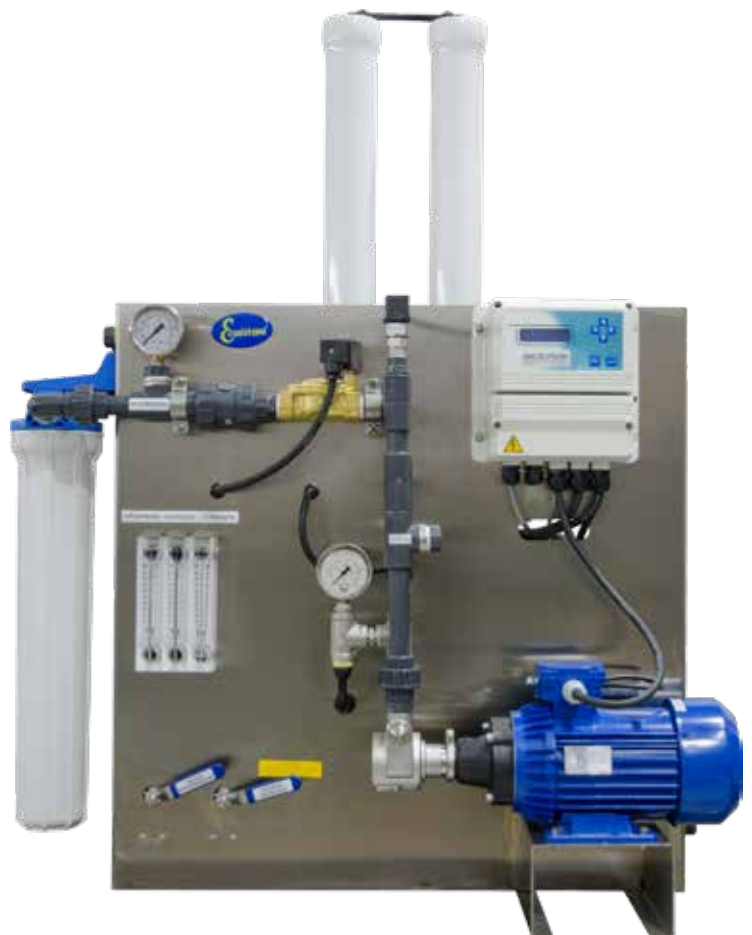
REVERSE OSMOSIS RO S 2 UBE