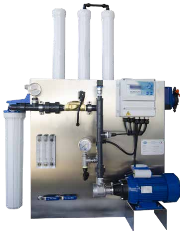
REVERSE OSMOSIS RO S 3 UBE